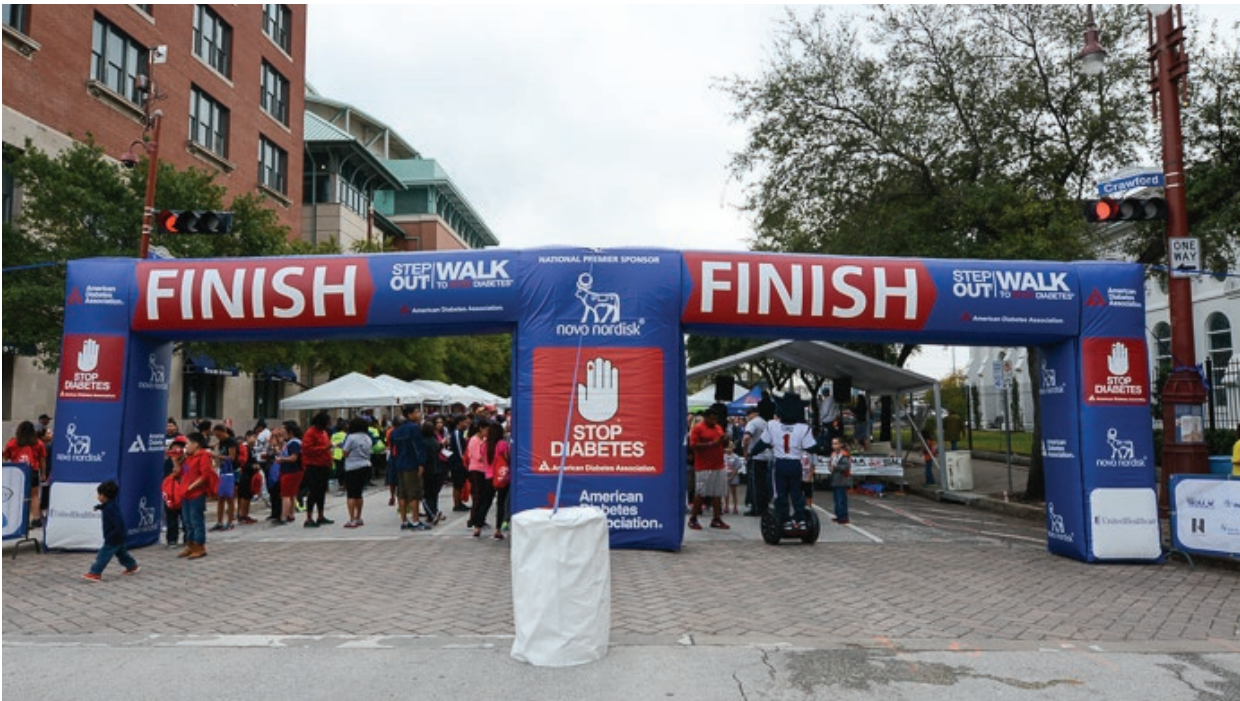
Step Out: Houston, TX Nov. 22, 2014