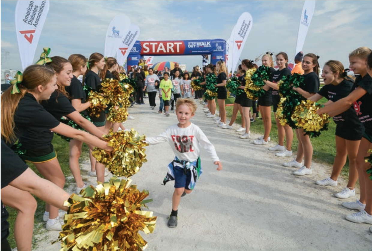
Step Out: Buffalo Grove Sept. 20, 2014