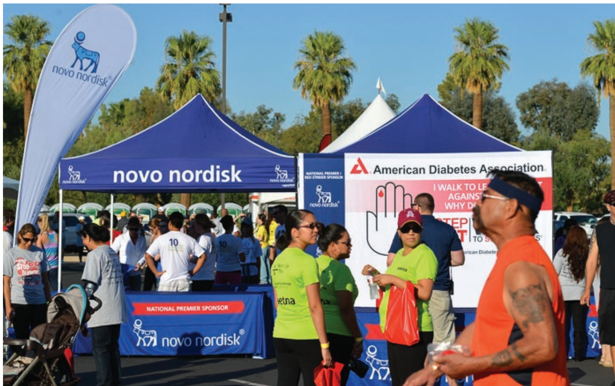
Step Out: Phoenix, AZ Oct. 11, 2014