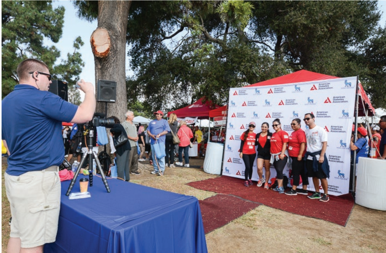
Step Out: Los Angeles, CA Nov. 15, 2014